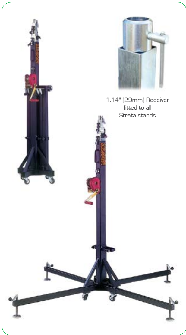
1.14" (29mm) Receiver fitted to all Strata stands