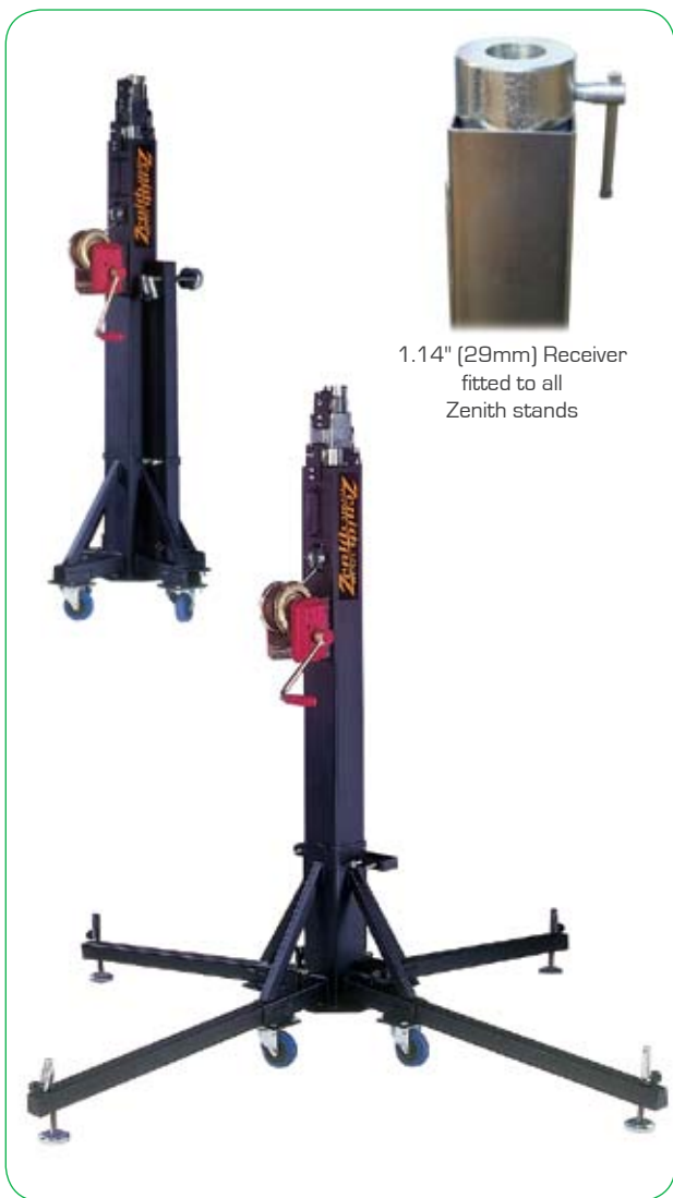
1.14" [29mm] Receiver fitted to all Zenith stands